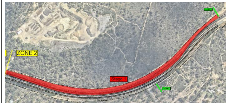
Zone 2, Stage 1: