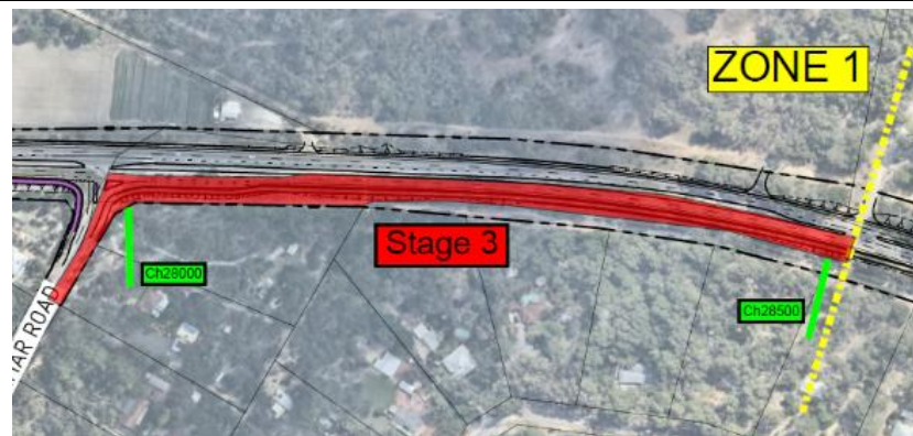
Zone 1, Stage 3: